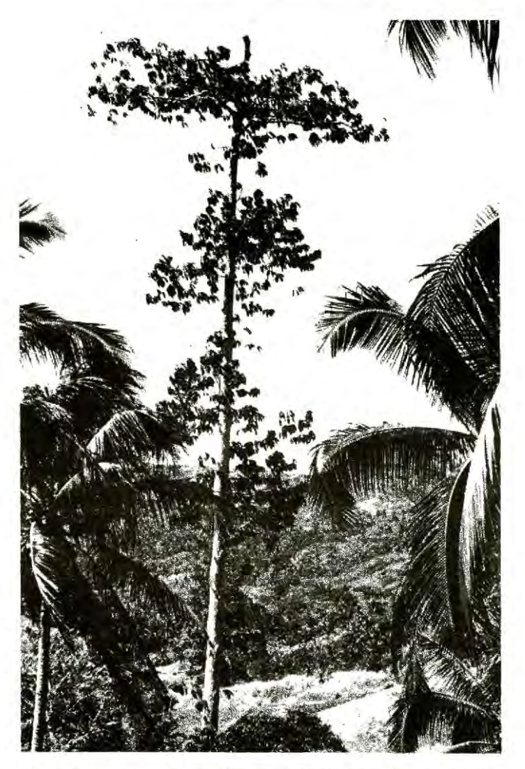
Figure 1. Dipterocarpus grandiflorus Blanco (actually 40 meters high) with coconut trees in the foreground.

1.5 Gm. and this was re-chromatographed over 115 Gm. of 15\% \text{ AgNO}_3/\text{Al}_2\text{O}_3 using gradient elution (hexane-diethyl ether-methanol). Individual fractions were concentrated on a water bath and subjected to preparative gas chromatography on a 12ft. x 0.25 in. column, packed with 10% Carbowax 20M coated on 60-80 mesh neutral and silanized Chromosorb W. All components were characterized by carefully comparing their infrared spectra with standard infrared spectra in one of the