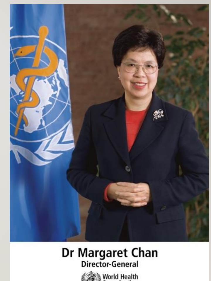
World Health Organization

"You cannot deliver health care if the staff you trained at home are working abroad."