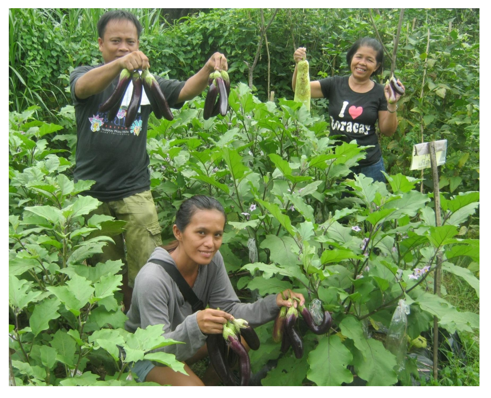
Farmer-Scientists show their harvested eggplants.