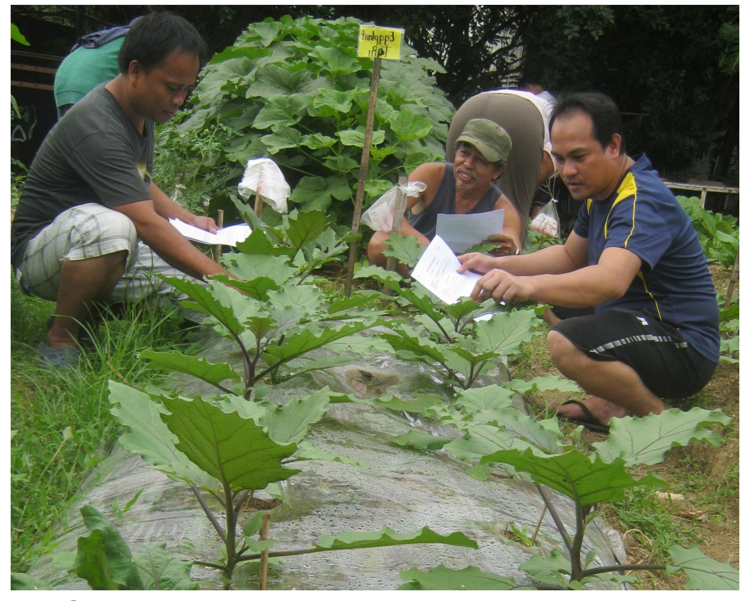
Farmer-Scientists measure growth of eggplants and make records for their report.