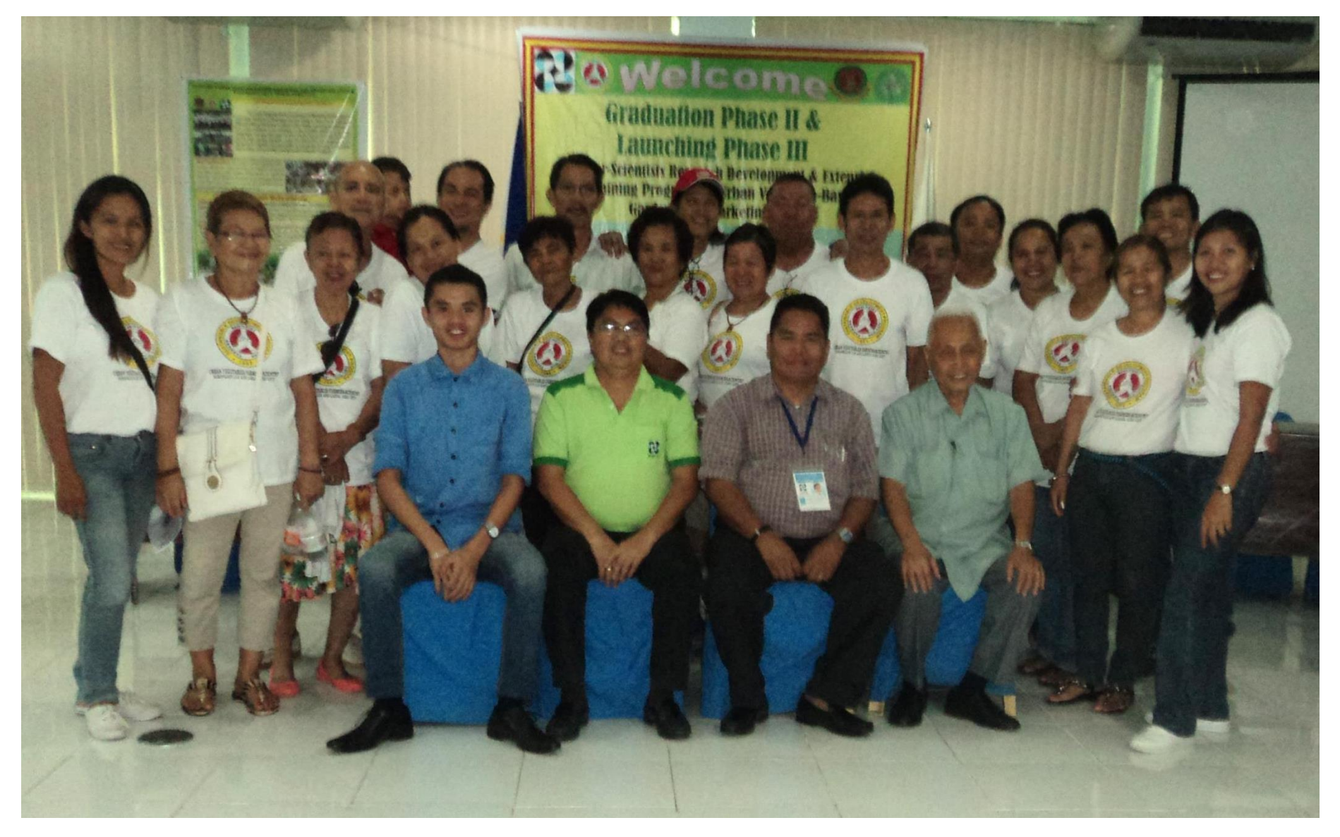
Farmer-Scientists Graduates of Phase II May 22, 2015