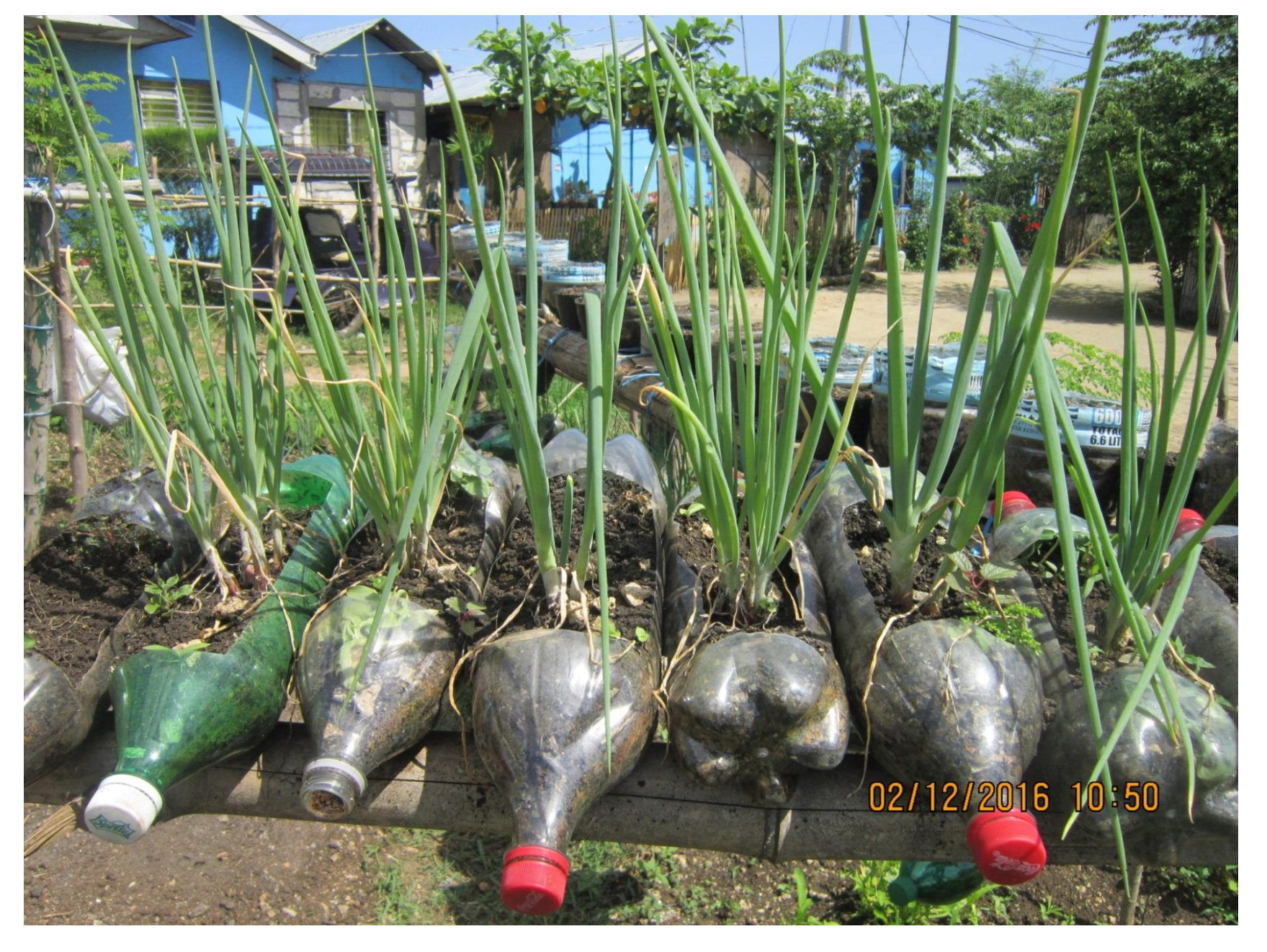
A Green Onion plants grown in empty coke bottles.