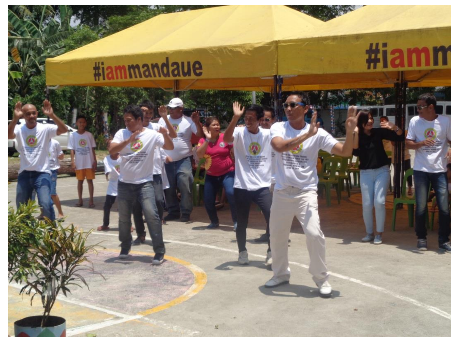
Former drug dependents, now Farmer-Scientists from Brgy. Subangdaku, Mandaue City, Cebu render a dance for an intermission number during the program.