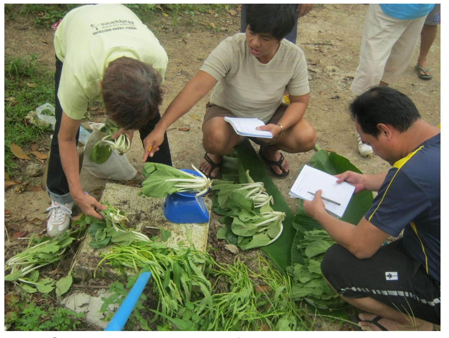
Farmer-Scientists take weight of their harvested vegetables.