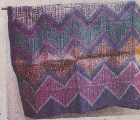
COLORFUL mats woven by the Badjao of Zamboanga

1780 is an offshoot of SariSariStore.com, a local online store where a hodgepodge of products (from apparel to food to electronics), services, and even jobs are offered (patterned after the neighborhood sari-sari store). The brand “1780” represents the country’s 17 regions and 80 provinces, since the shop’s promise is to “exhibit the best of the Philippines to the rest of the Philippines.”