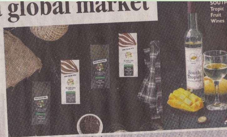
DARK chocolate and spicy dark chocolate bars from Kablon Farms

entrepreneurs were initially tapped by 1780. Those from the textile industry include: Granddaughters and students of 1998 National Living Treasure Awardee Lang Dulay of the