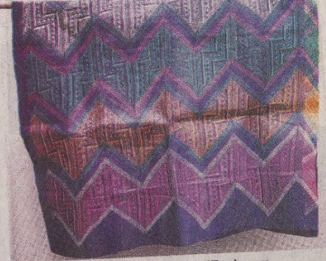
COLORFUL mats woven by the Badjao of Zamboanga

1780 is an offshoot of SariSariStore.com, a local online store where a hodgepodge of products (from apparel to food to electronics), services, and even jobs are offered (patterned after the neighborhood sari-sari store). The brand "1780" represents the country's 17 regions and 80 provinces, since the shop's promise is to "exhibit the best of the Philippines to the rest of the Philippines."