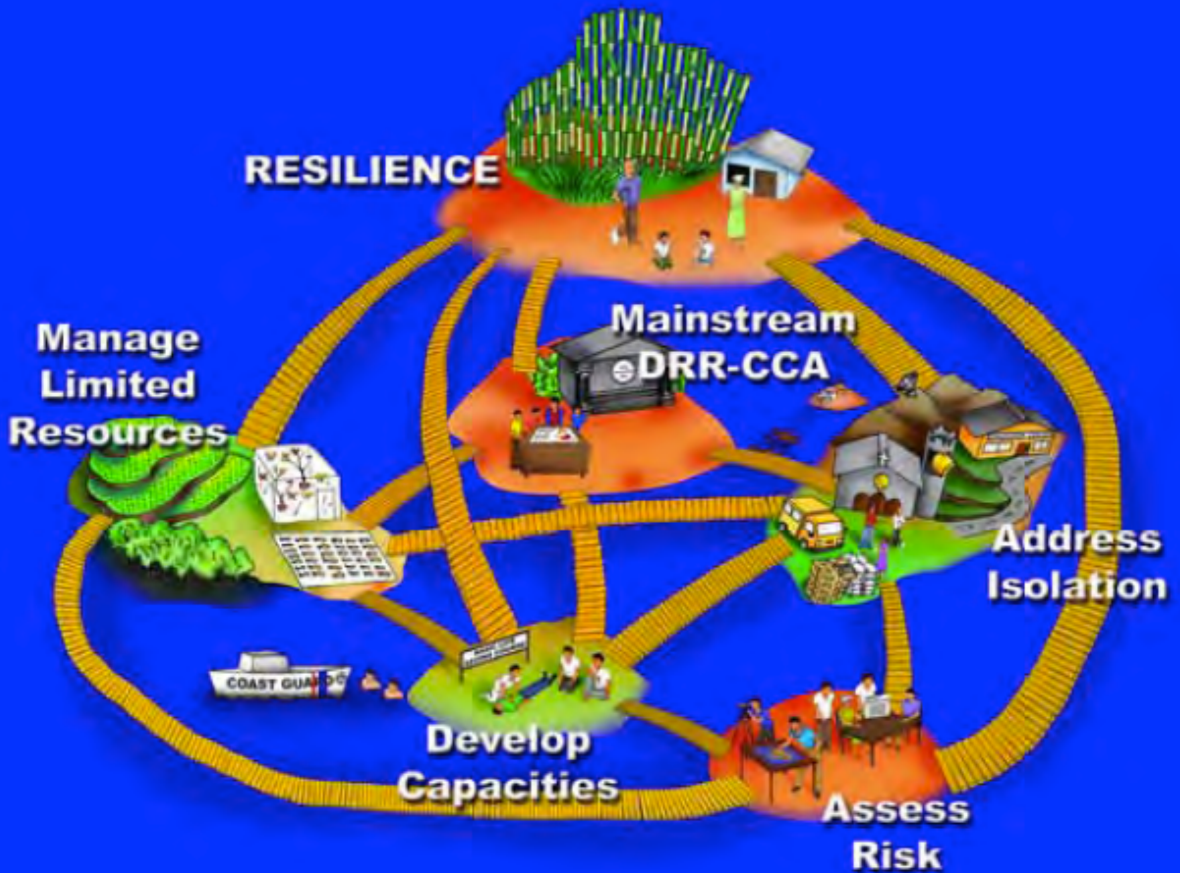
Fig. 2.3. Pathways to disaster resilience of small islands