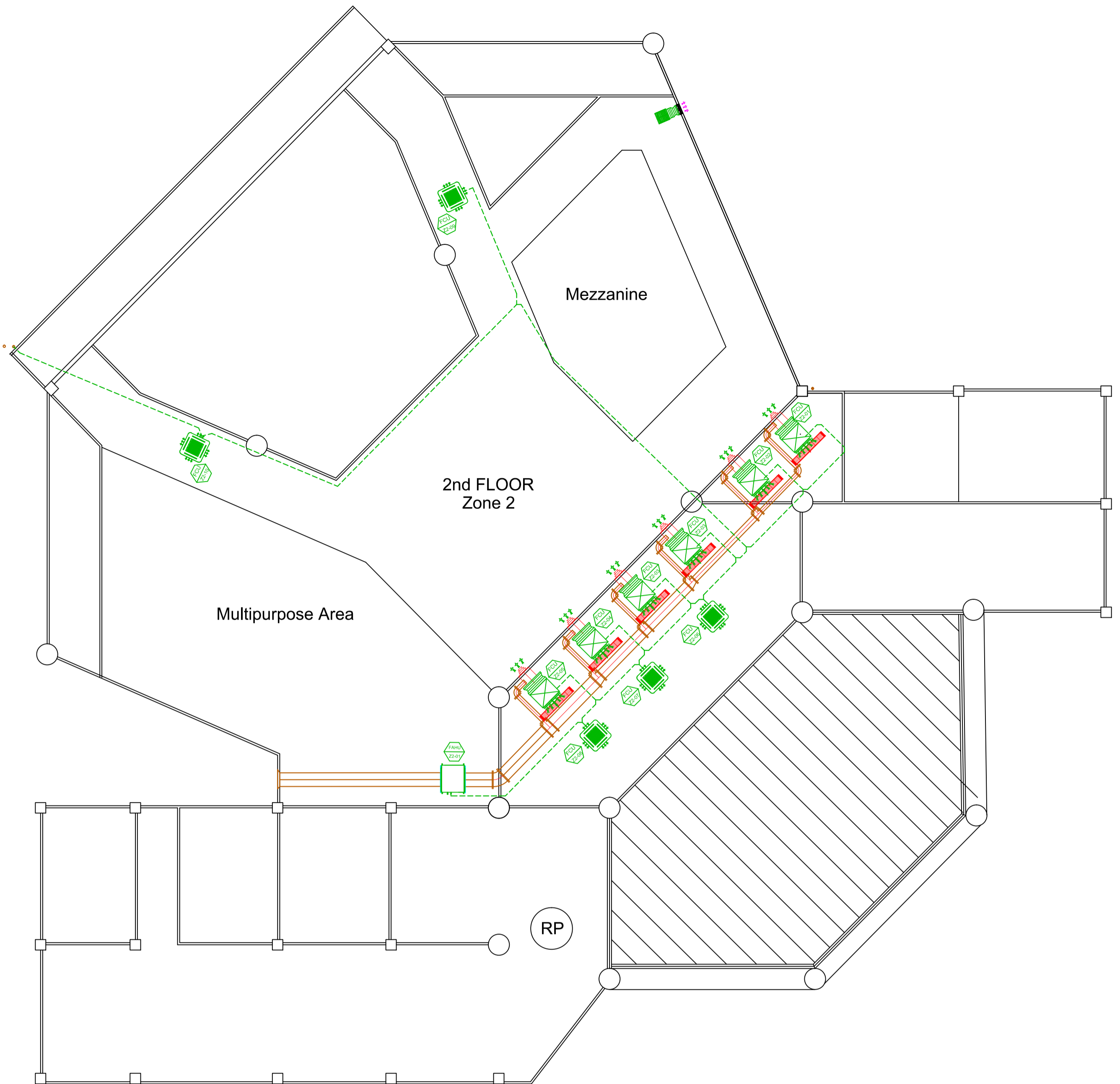
SECOND FLOOR ZONE 2