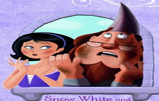
Snow White and the Seven Dwarves