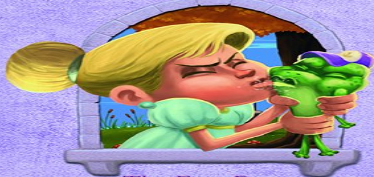
The Frog Prince