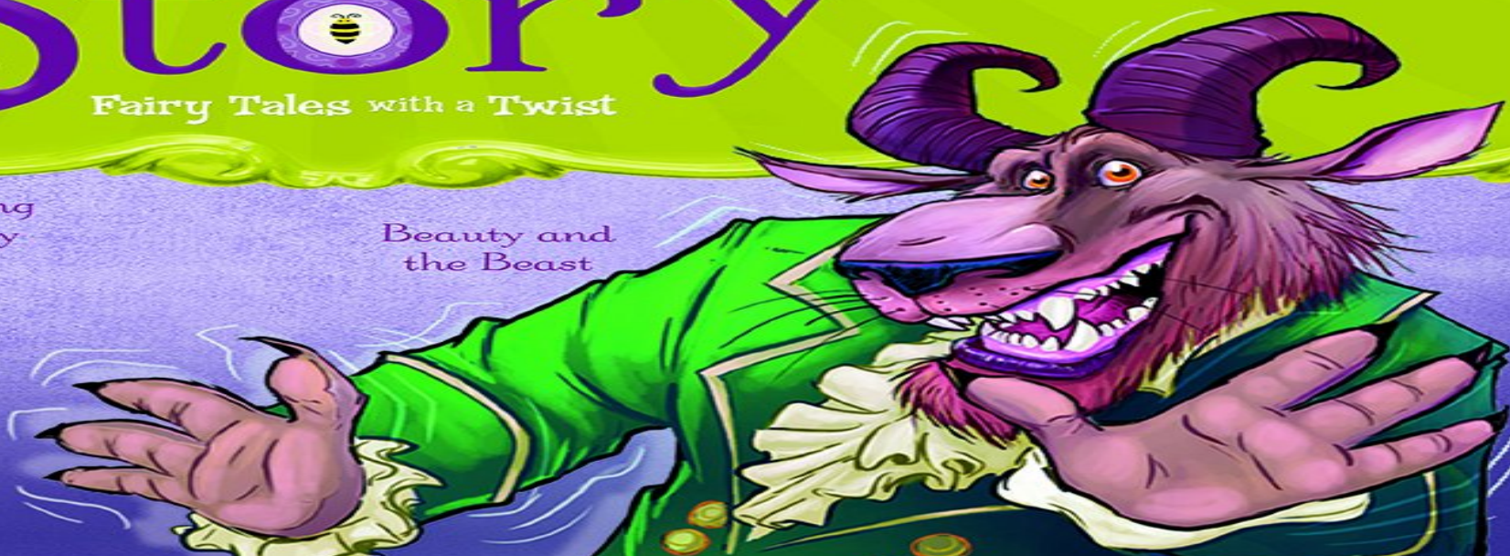
Beauty and the Beast